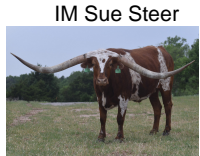
IM Sue Steer